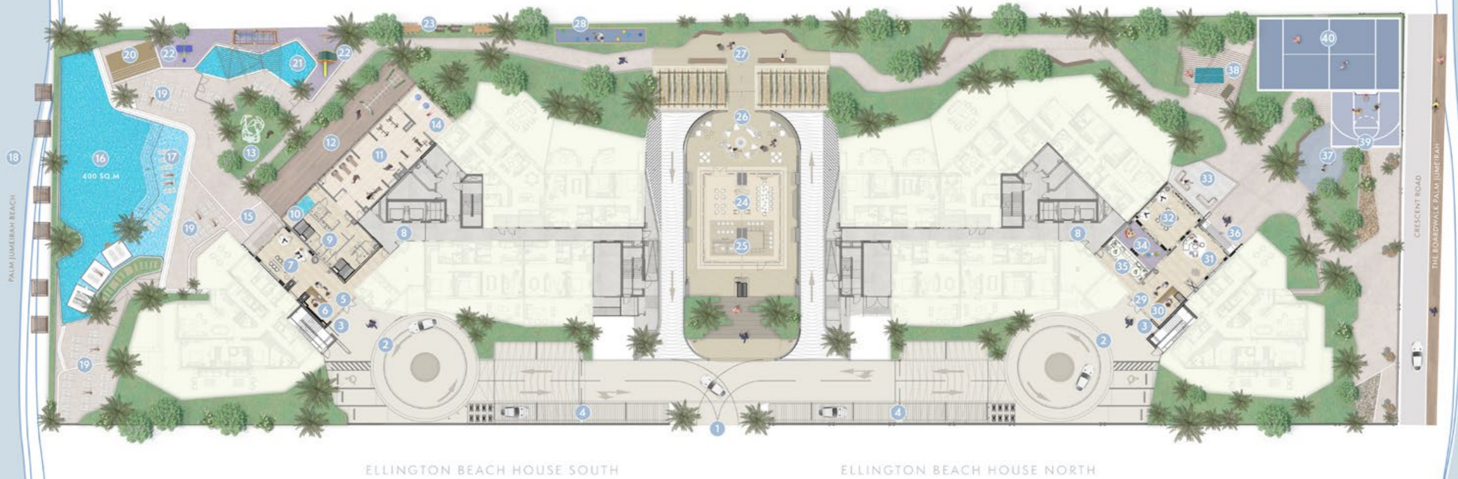
ELLINGTON BEACH HOUSE SOUTH