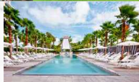
LUX BRICKELL HOTEL & RESIDENCES