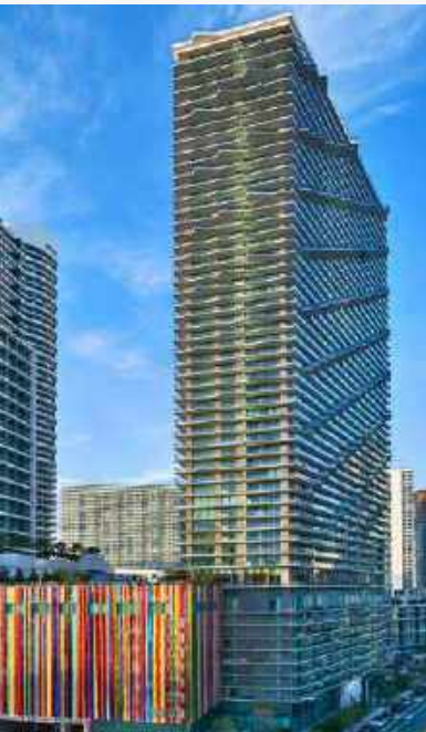
BRICKELL HOTEL & RESIDENCES