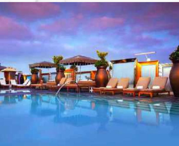
BEVERLY HILLS HOTEL