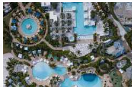
BAHA MAR HOTEL & RESIDENCES